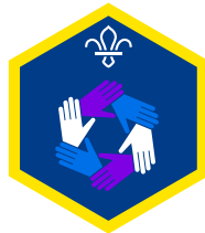
Cubs Teamwork Challenge Award