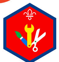
Beavers My Skills Challenge Award