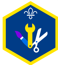
Cubs My Skills Challenge Award