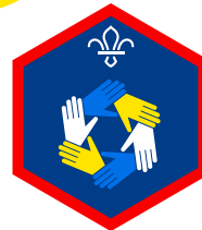
Scouts Teamwork Challenge Award